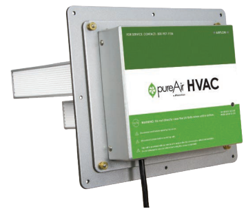
Powder-coated Housing for Dual Probe Model