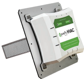
Molded Plastic Housing for 5", 9", 14" Models