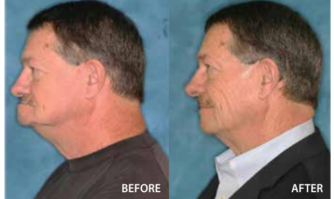
Side-by-side comparison shows actual patient results showing old dentures versus new implants.