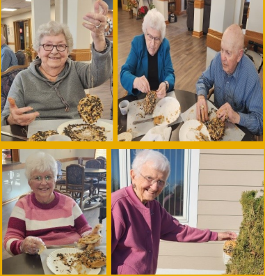
Above: Tenants made bird feeders out of bagels, peanut butter and birdseed to hang and attract birds outside of their apartment windows!