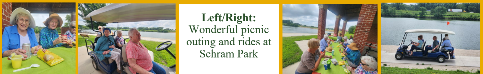
Left/Right: Wonderful picnic outing and rides at Schram Park