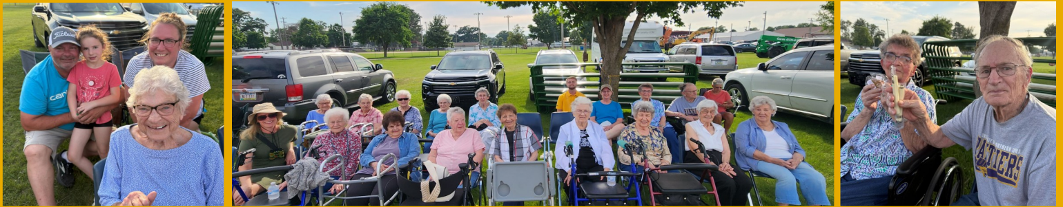
Above: Tenants took on the Delaware County Fair Parade! It's always a fun evening on the grounds.