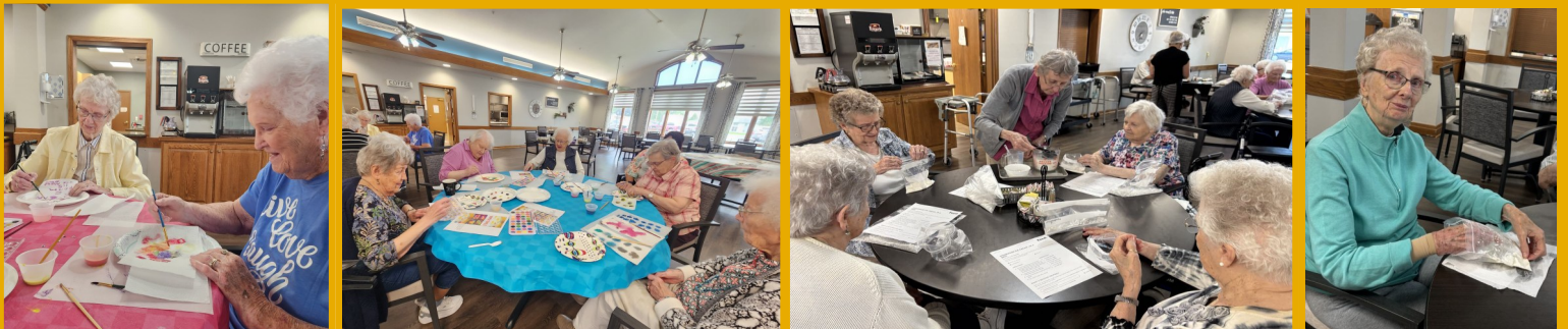
Above: Creative fun with Watercolor Art!