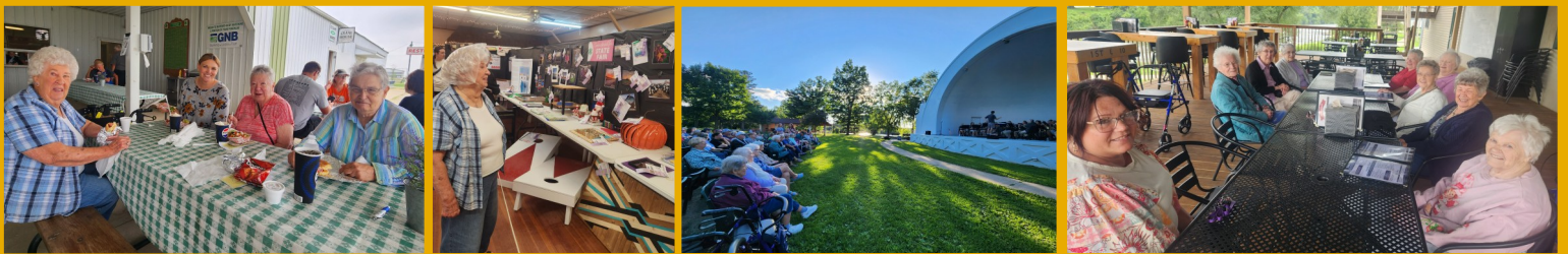
Above: Fair Lunch & 4H Exhibit Viewing.