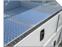
ALUMINUM TREAD PLATE TRIM