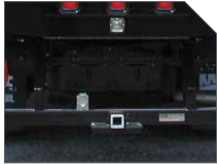
8' UNDERBODY STORAGE COMPARTMENT