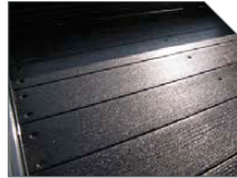
PINE WOOD OR APITONG WOOD FLOOR