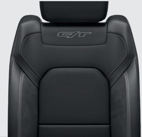
Leather-Trimmed Bucket—Black Included with G/T Package