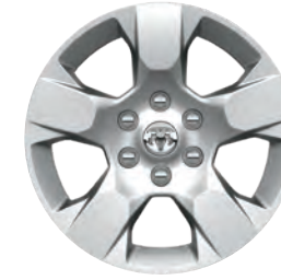
18-inch Painted Aluminum Included with Max Tow Package, Chrome Appearance Group and Sport Appearance Package (WBB)