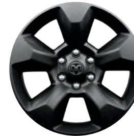
20-inch Black-Painted Aluminum Included with Night Edition (WRW)