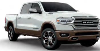
Limited Longhorn ™ shown in Ivory White Tri-Coat with RV Match Walnut Brown Metallic lower