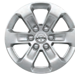
18-inch Cast Aluminum Standard (WBC)