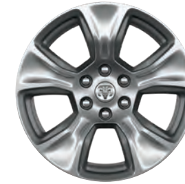
20-inch Premium Aluminum Painted/Polished Optional (WRB)