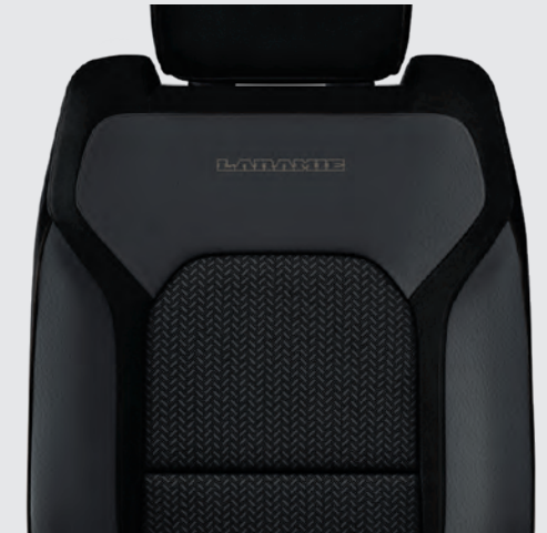
Leather-Trimmed with Perforated Inserts—Black with Medium Graystone accent stitching Standard