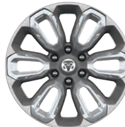
20-inch Aluminum with Premium Painted and Polished Inserts Included with Sport Appearance Package (WRJ)