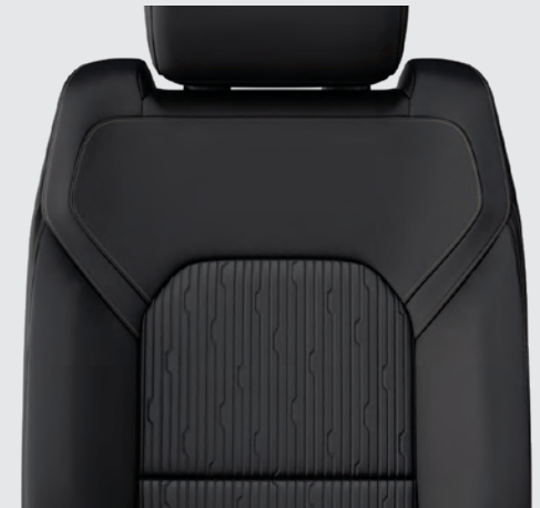
Cloth Bench—Black Optional