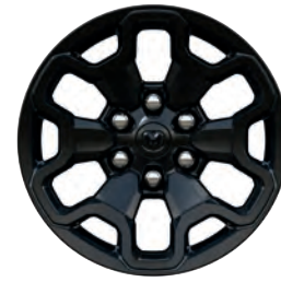
18-inch Black-Painted Aluminum Standard (WS4)