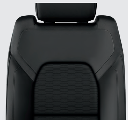
Vinyl with Cloth Inserts—Black with Medium Graystone accent stitching Included with BackCountry Package