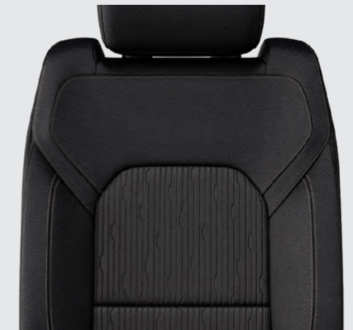
Cloth—Black with Medium Graystone accent stitching Included with all-Black interior on Sport Appearance Package and Night Edition