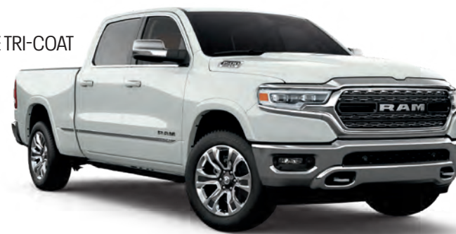
IVORY WHITE TRI-COAT