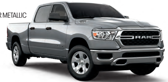
BILLET SILVER METALLIC