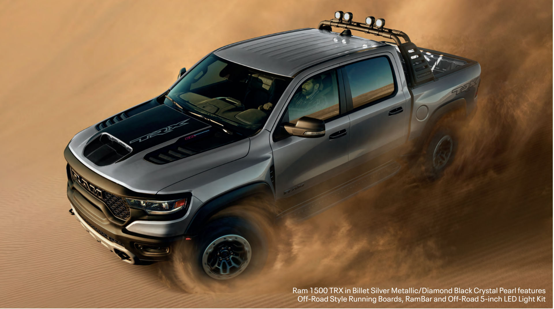
Ram 1500 TRX in Billet Silver Metallic/Diamond Black Crystal Pearl features Off-Road Style Running Boards, RamBar and Off-Road 5-inch LED Light Kit