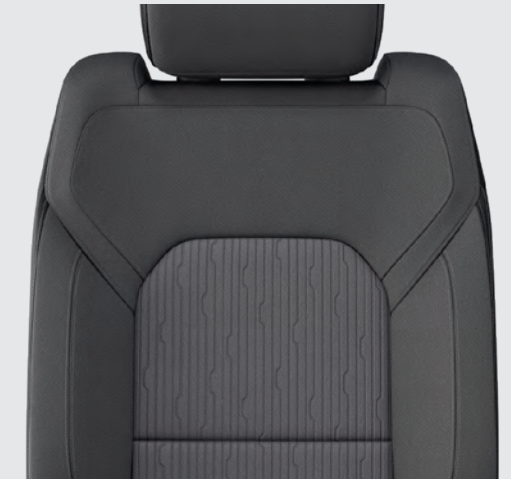
Cloth—Diesel Gray/Black with Diesel Gray accent stitching Standard