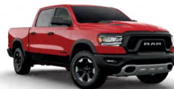
Rebel ® shown in Flame Red with Diamond Black Crystal Pearl lower