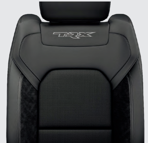
Premium Leather Bucket with Suede—Black with Gray accents Optional