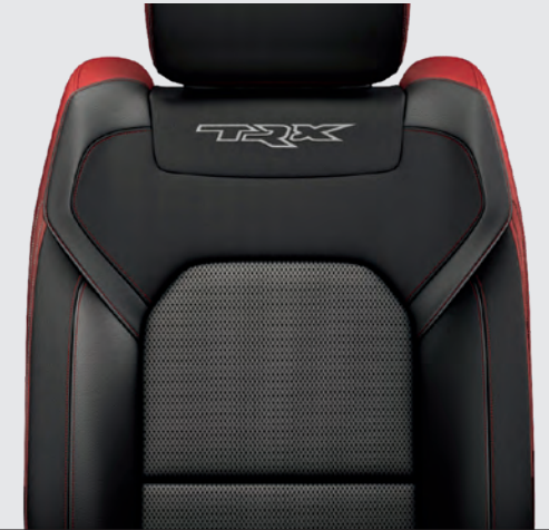
Vinyl/Cloth Bucket—Black/Red with Red accent stitching Standard