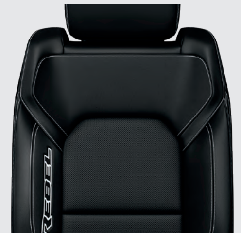
Leather-Trimmed Bucket—Black Optional