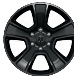
20-inch Black- Painted Aluminum Included with Night Edition (WRP)