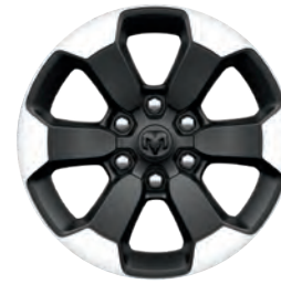
18-inch Black-Painted Aluminum/ Diamond-Cut Finish Standard (WBJ)