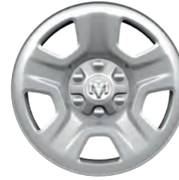
18-inch Steel Painted Standard (WBF)