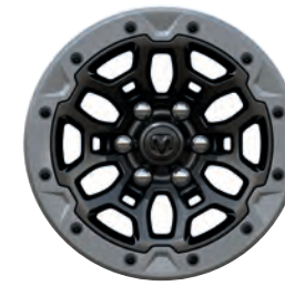
18-inch Beadlock-Capable Aluminum Optional (WS1)