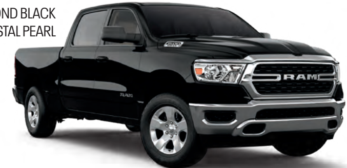
DIAMOND BLACK CRYSTAL PEARL