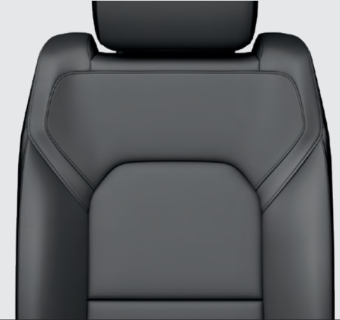
Vinyl Bench—Diesel Gray/Black Standard