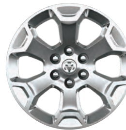
20-inch Chrome-Clad Aluminum Optional (WRK)