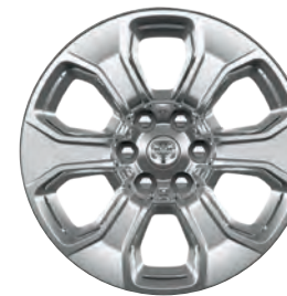
20-inch Premium Chrome-Clad Aluminum Optional (WRD)