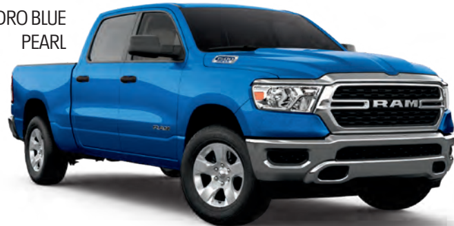
HYDRO BLUE PEARL