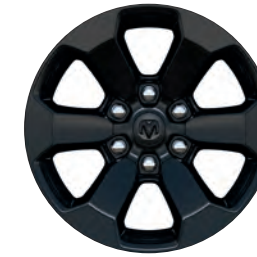
18-inch Gloss Black-Painted Aluminum Included with Night Edition (WBS)