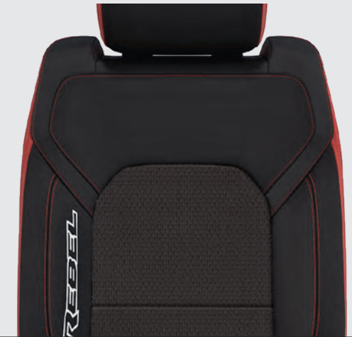
Vinyl/Cloth Bucket—Black/Dark Ruby Red Standard