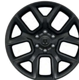
22-inch Black-Painted Aluminum Included with Night Edition Optional with Sport Appearance Package (WPH)