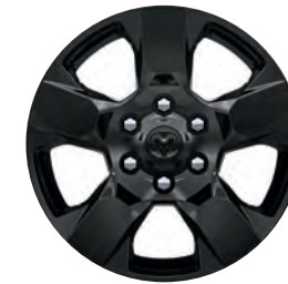
18-inch Black-Painted Aluminum Included with BackCountry Package (WBP)