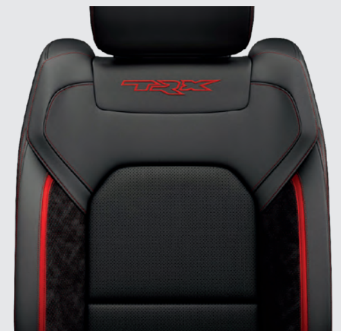
Premium Leather Bucket with Suede—Black with Red accents Optional